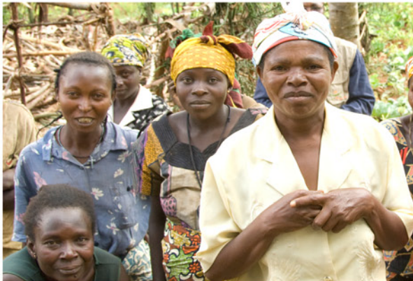
Women waiting to fill out enrollment forms, DRC